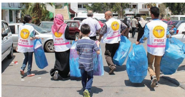
PMRS members deliver vital humanitarian aid to those affected by airstrikes in Gaza.