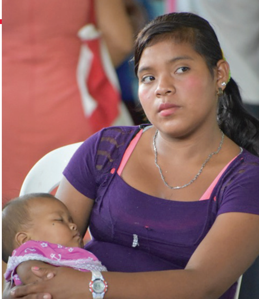
A mother attends a human rights training in Nicaragua with her child.