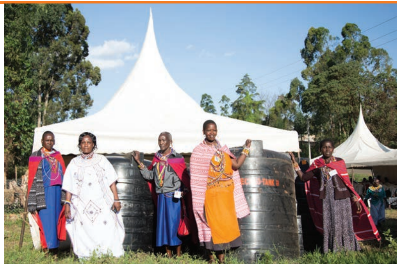
Indigenous women receive the water tanks we delivered on our trip in October.

Thanks to your contributions, we have installed water storage tanks that collect rainfall and secure clean, easy-to-access water for women and families. IIN was also able to distribute over 100 energy efficient cookstoves, an updated Indigenous design that burns plant waste instead of wood.