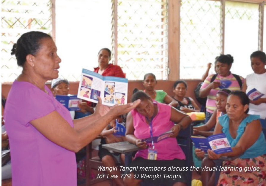
Wangki Tangni members discuss the visual learning guide for Law 779.