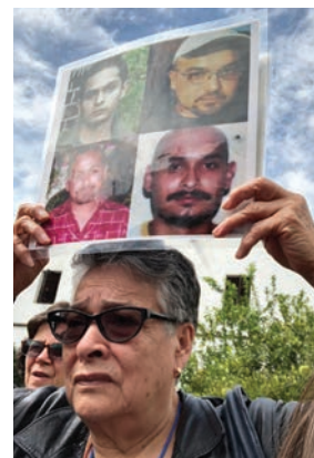
A woman in Mexico City carries a sign of her sons who disappeared migrating to the US.