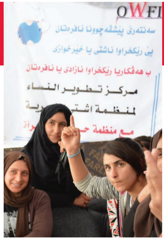
Women from OWFI gather to meet and ask visiting MADRE staff questions.

One staff member said, "Despite all my years of doing this work, I never thought of this simple exercise,