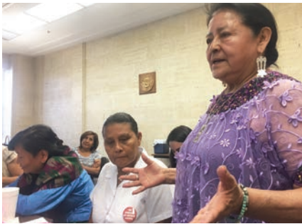
Indigenous women from around the world convening at MADRE's Arizona delegation.

For instance, MADRE organized an international delegation of Indigenous women leaders to Arizona earlier this year, where they joined in a healing session. Led by