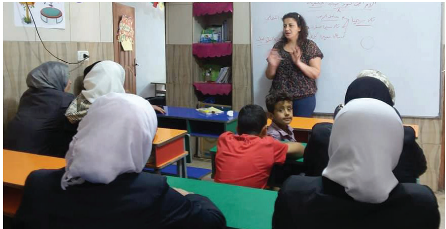
A woman from SWL teaching a political awareness session.

Now, Amina also holds regular discussion circles with groups of girls and older women. She encourages mothers to support their daughters to finish their education and pushes her