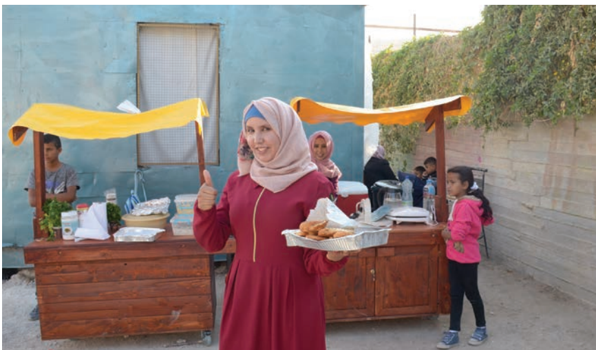
With the help of Dalia, this young woman opened the mobile restaurant seen behind her to raise money and boost her economic independence.

Dalia is a grassroots organization in Palestine that strengthens communities and the rights of women and girls by creating opportunities