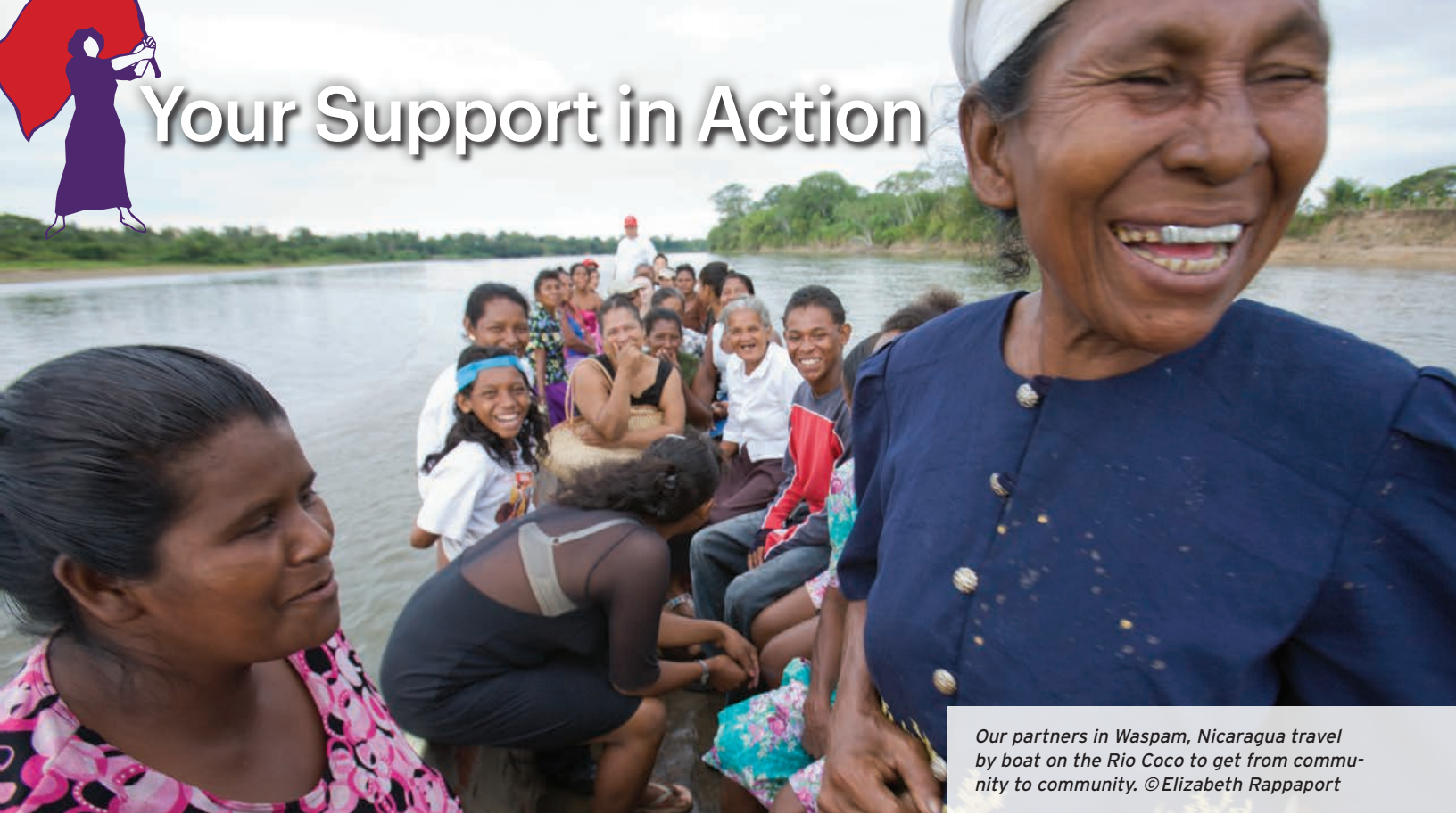
Our partners in Waspm, Nicaragua travel by boat on the Rio Coco to get from community to community.