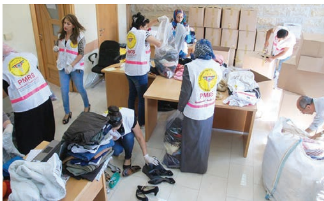
When disaster strikes, your support helps us mobilize emergency grants to grassroots women's organizations on the frontlines.